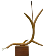
WAITING FOR SPRING